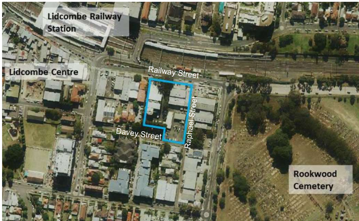
Figure 1: Subject site (blue outline) and surrounding area.

The site is approximately 7km east of the Parramatta CBD and 15km west the Sydney CBD.