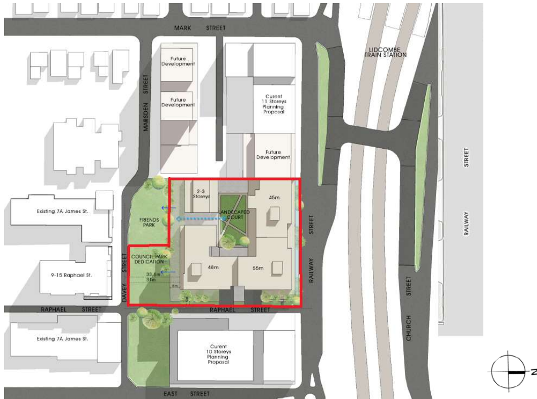
Figure 3: Development concept of proposed new open space reserve within site and surrounding context.

Supporting the proposal is a preliminary design concept (Figure 3 and 4) for a mixed commercial and residential development with a maximum building height of 45m for the site with a taller element up to 55m for a limited portion in the north eastern corner of the site with approximately 875m 2 reserve dedicated to council for the future 'Friends Park'.