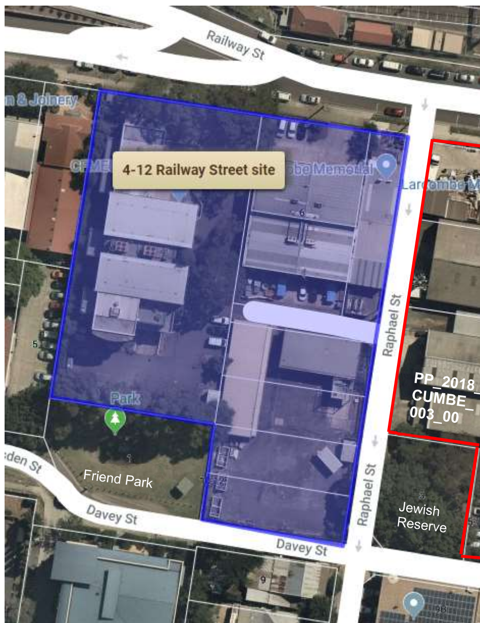
Figure 2: Subject site (blue) and planning proposal PP_2018_CUMBE_003_00 (red).